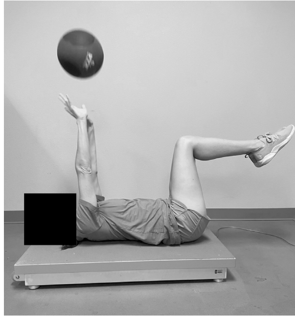
Figure 1. A participant performing the supine medicine ball throw. For each throw, participants laid on a force plate in the supine position with their hands on the ball and knees and hips flexed at 90°. Participants were instructed to throw the ball explosively upward with as much force as possible, using a motion similar to a basketball chest pass.