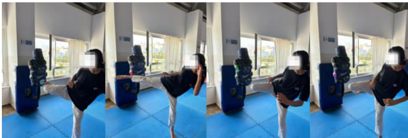
Figure 1. FITLIGHT Trainer Taekwondo Technical Reaction Test.

chest level (ap chagi level). Throughout the test, athletes were instructed to stand on their non-kicking support leg, ensuring their kicking foot did not touch the ground for the entire duration of the 10-strike sequence. The protocol involved the random activation of a sensor, which occurred at a fixed interval of one second after the deactivation of the previous sensor. This process was repeated until a total of 10 sensors had been activated and deactivated. Athletes performed the full test series beginning with the leg of their choice and were provided a two-minute rest period between testing each leg. As part of this protocol, the athletes' leg dominance was not recorded. Prior to the test, participants were allowed to practice with three sensors. The measurement results were recorded on a data sheet as the number of deactivated sensors, average reaction time, and total duration (Figure 1). A Hit was recorded when a lit sensor was deactivated by a valid kick; an error was any missed or out-of-sequence attempt or a failure to deactivate a lit sensor within the trial window; errors were excluded from Hits but contributed to total duration.