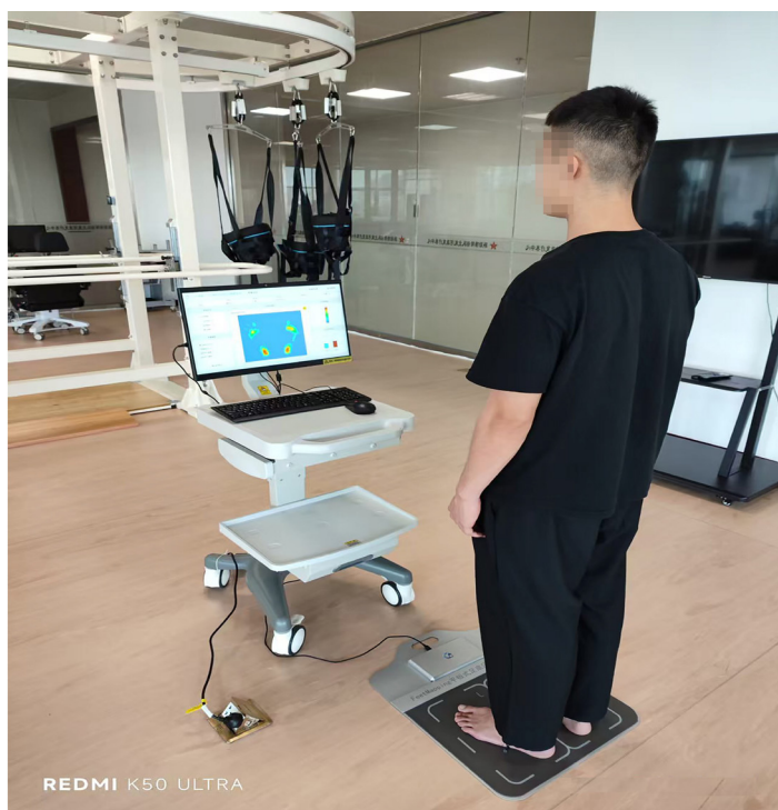
Figure 2. Assessment of plantar pressure: Pre-test positioning.