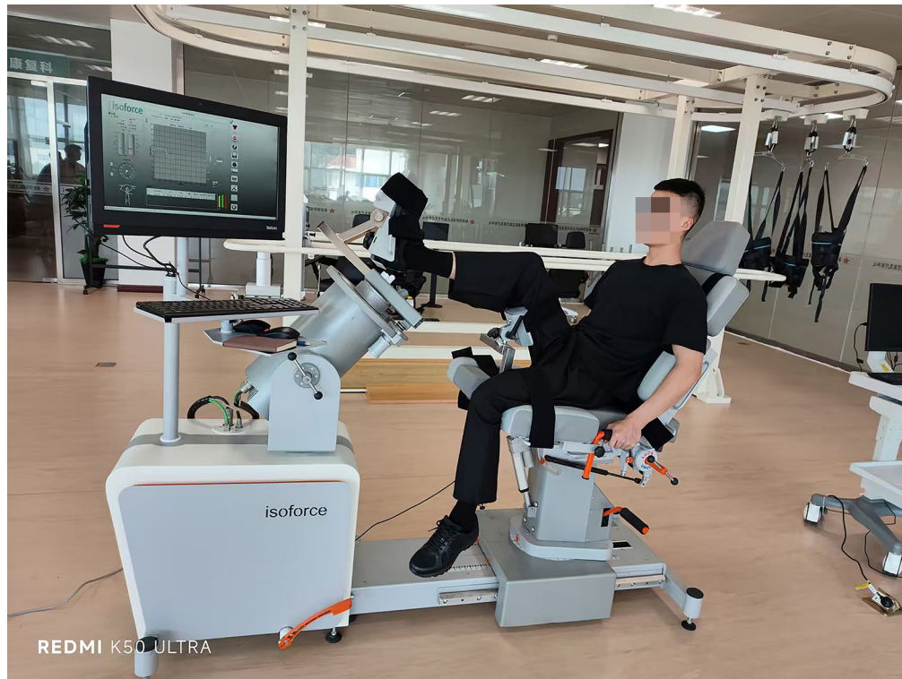
Figure 3. Isokinetic muscle strength testing setup.

operates using the piezoresistive method and the sampling frequency is 140Hz.