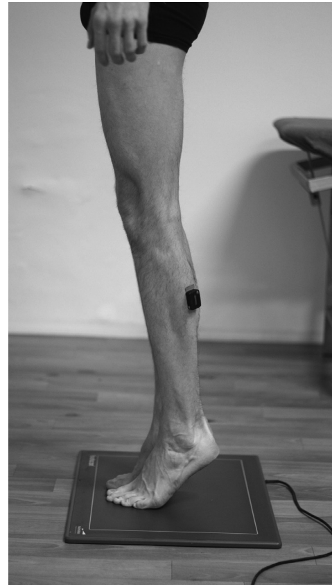
Figure 2. Side view of transition position from concentric to eccentric phase during standing heel raise task.

m. gastrocnemius, m. soleus, tendo calcaneus, current purulent, fungal diseases, burns, scalds, varices, or any neurological diseases.