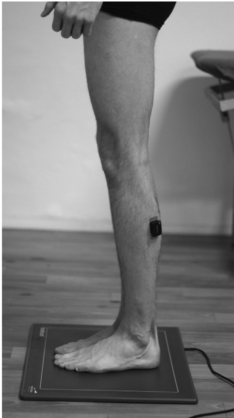
Figure 1. Side view of starting/final during standing heel raise task.