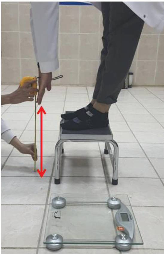
Figure 2. Anterior trunk flexion test (the distance between the middle finger tip and the floor is detected with a red arrow).