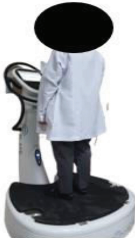
Figure 3. Standing on Power Plate® Pro7HCTM with slight knee flexion.

next session. Three sessions were conducted 32 . The control group followed the same procedure as the experimental group except that the participants were not given “real” sessions of mechanical vibrations. To ensure that the placebo treatment was as faithful as possible, the participants were informed by the examiner that they could not physically feel the vibration waves because the vibration waves were too small to be detected. After vibration and placebo interventions, the flexibility of the anterior trunk flexion was