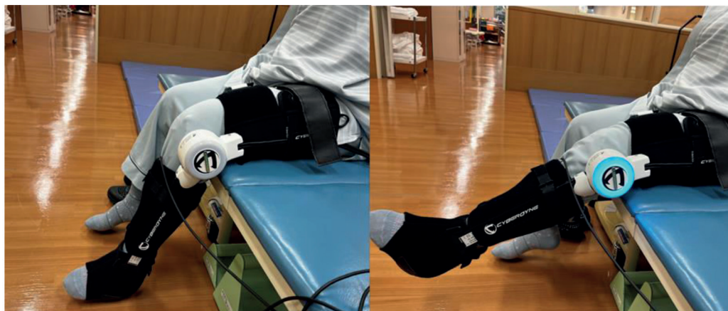
Figure 2. Patients in the HAL-SJ group sit in bed and perform extension and flexion exercises with the affected knee joint using the single-joint hybrid assistive limb (HAL-SJ).