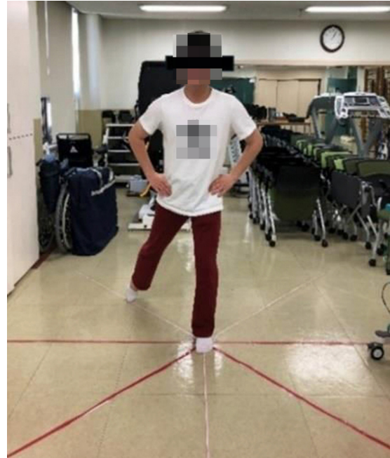
Figure 2. Dynamic balance ability test (SEBT).

Statistical analyses were performed using IBM SPSS Statistics for Windows, version 25.0 (IBM Corp., Armonk, NY, USA). Due to the small sample size ( n=5 per group), normality of the data distribution could not be assumed; therefore, non-parametric tests were employed to ensure the validity of the results. All descriptive statistics are presented as mean \pm standard deviation (SD), with the level of statistical significance set at \alpha < 0.05 for all tests. To evaluate the effects of the interventions, the Wilcoxon signed-rank test was first conducted to assess within-group changes from pre- to post-intervention in muscle activity, grip strength, dynamic balance, peripheral circulation,