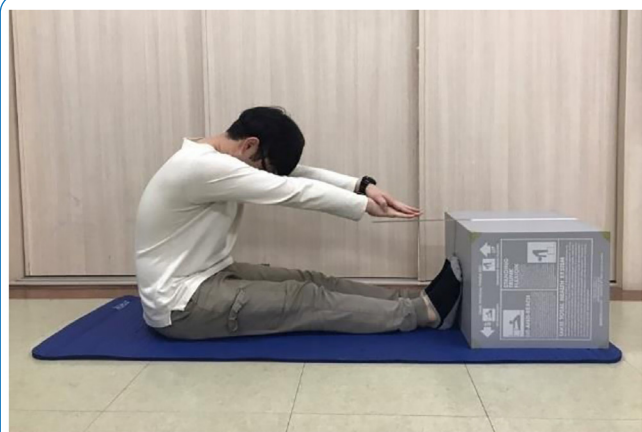
Figure 3. Sit-and-reach test.

and flexibility. Subsequently, the Mann-Whitney U test was utilized to compare the relative effectiveness between the two groups. This analysis focused on the magnitude of change, calculated as the delta score ( \Delta : post-test value minus pre-test value), to determine if significant differences existed between the Active Vibration Exercise